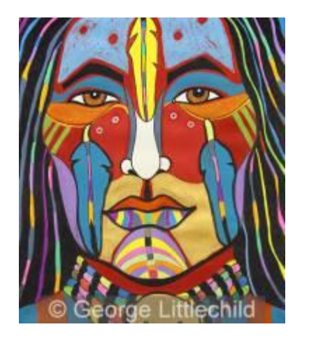
Rainbow Man, Warrior 22x15 2012