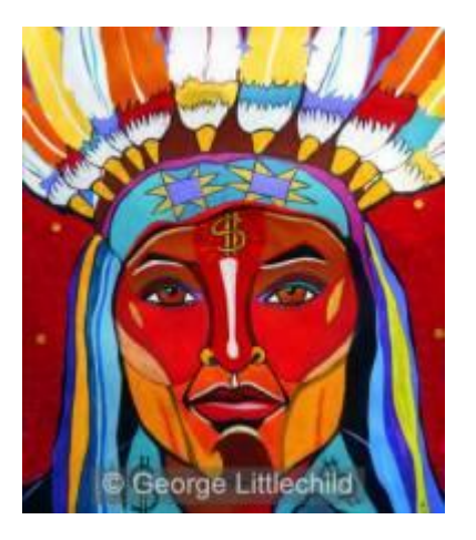
Bling Bling Chief Mixed Media, 48 x 38 2012