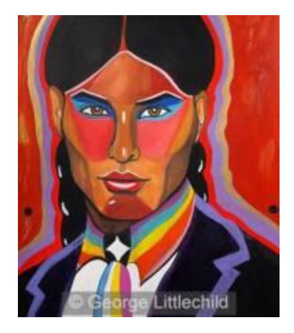
Warrior, Education, Graduate Mixed media, 30x22 2017