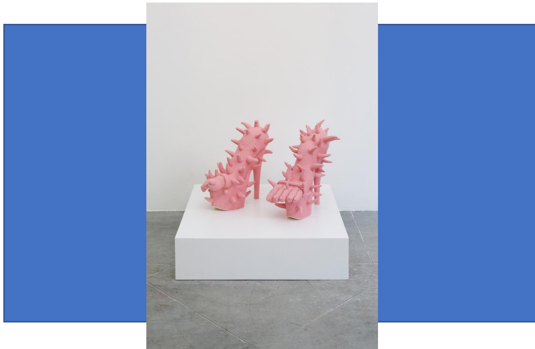
Dancing at the end of the world Ceramic, Lumina 2019