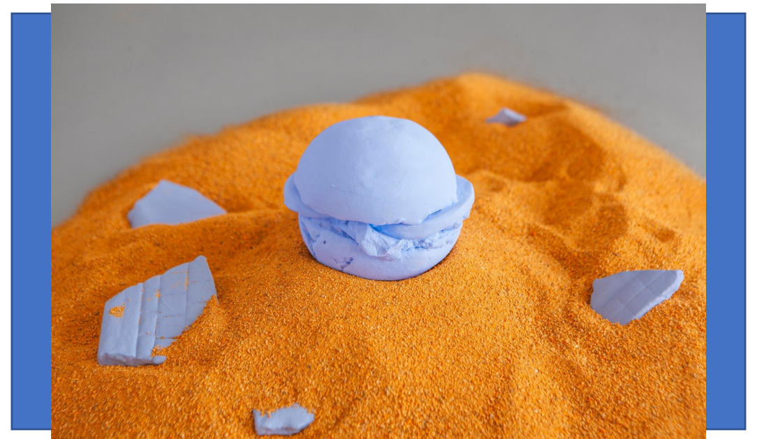
I'm not drunk 2019