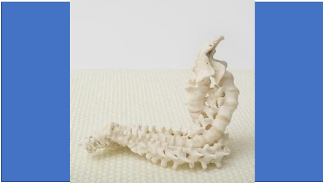
To twine Polyurethane Resin